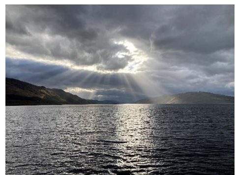
Figure 1 Olive Biggin-Lamming: Sun shining through the clouds over Loch Ness