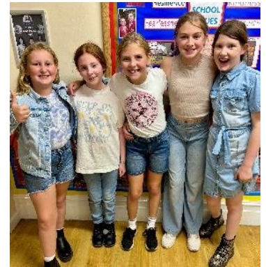
Jeans for Genes 2024

In September, a small group of Form VI girls attended a Modern Foreign Languages Day at Haileybury. They enjoyed a range of activities including winning the languages quiz; exploring different jobs in French; learning some Italian greetings; learning how to order food in German; and playing games such as Pétanque and Kahoot.