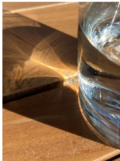
Figure 3 Sophie Wan: light through a glass